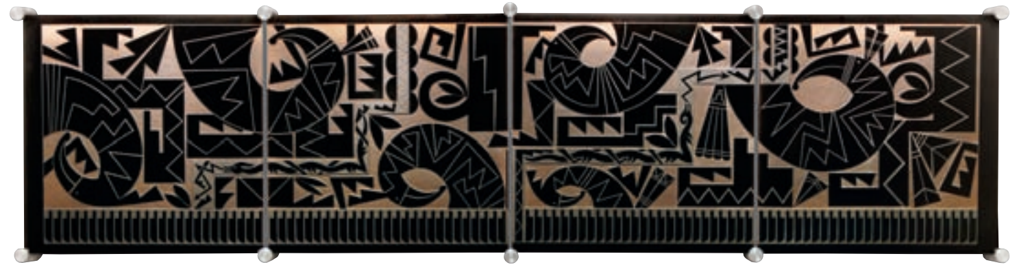
UNTITLED, GLASS, 26 X 99.

suddenly wasn't there. So working in the gallery provided a steady income." More and more pots were successful for her, and within a year she scaled back to part-time gallery work. By her 18th birthday she was pursuing art full time and showing her work at the Inter-Tribal Indian Ceremonial in Gallup, NM. By age 21 she had gallery representation in Scottsdale, AZ.