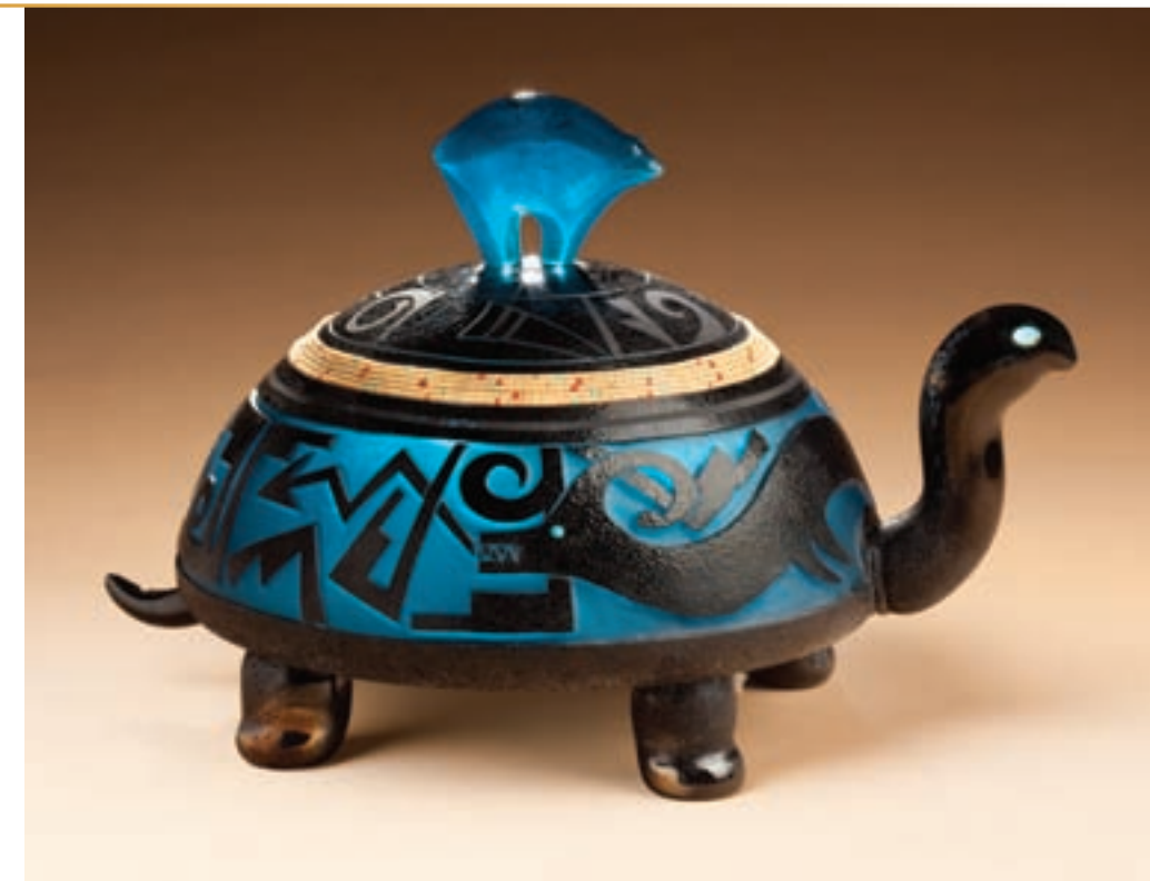
DA TRIBUTE, GLASS/HEISHI/TURQUOISE, 10 X 14 X 9.