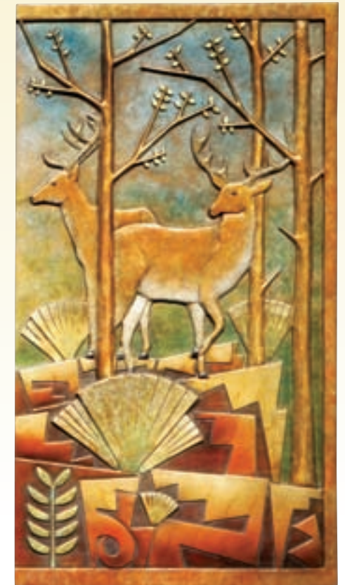
HUNTER'S BOUNTY, BRONZE, 26 X 15 EACH PANEL.