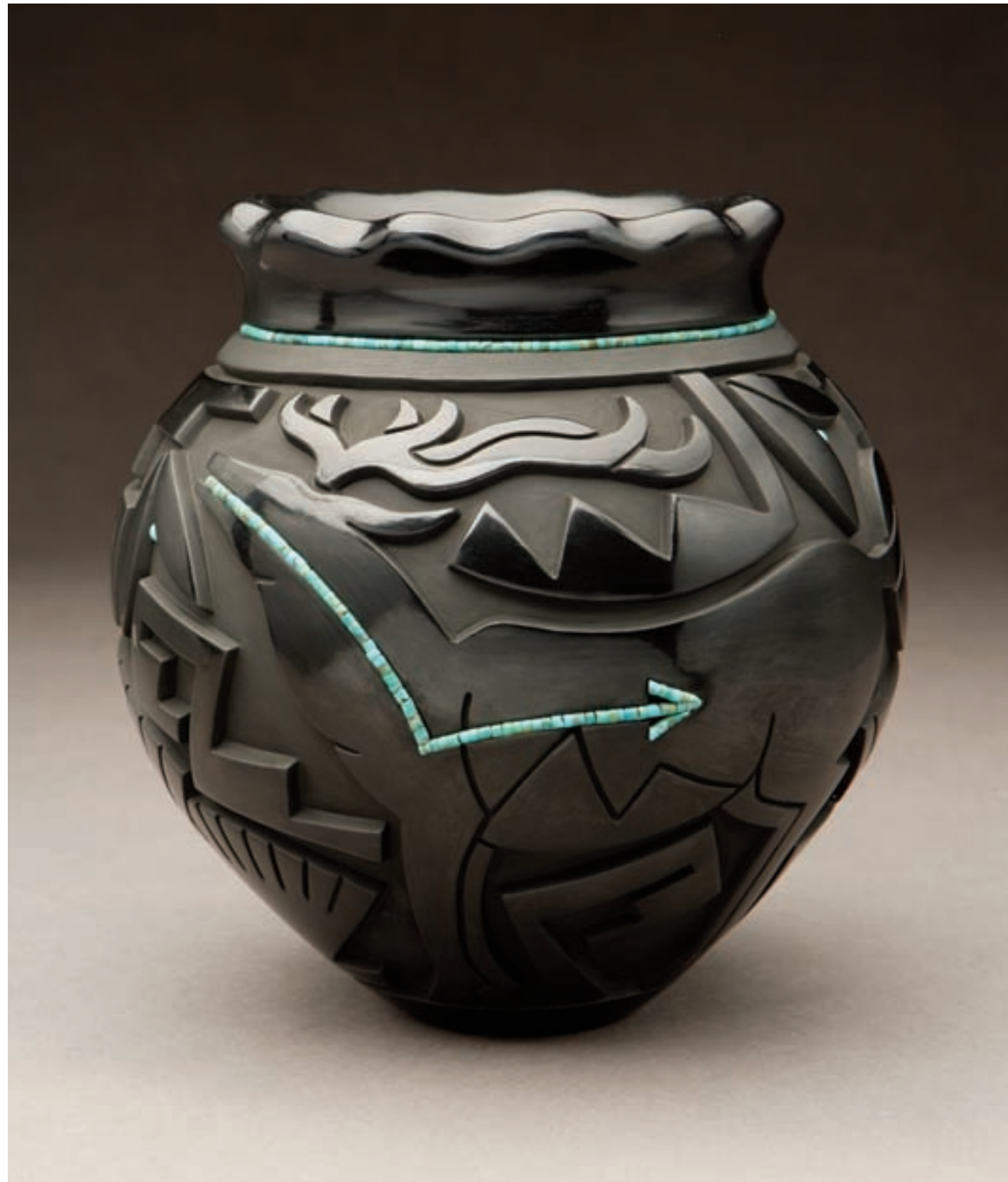
UNTITLED, CLAY/TURQUOISE, 7 X 6.

of media. Drawing on her experience creating jewelry, she designs and sculpts in clay intricate three-dimensional objects that combine tribal imagery with the less-is-more aesthetic of the Bauhaus movement, which has increasingly fascinated her over the past three years. “My new forms are very angular,” she observes.