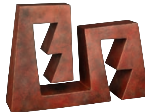
◀ ELEMENT VIII, BRONZE, 15 X 10 X 3.